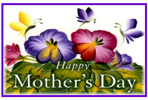
We wish all our mothers a happy and blessed Mother's Day!